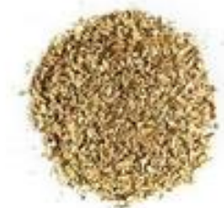
Patchouli - 15g