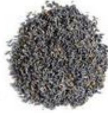
Lavender - 15g