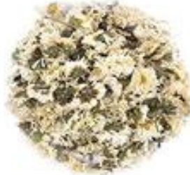
Chrysanthemum - 15g