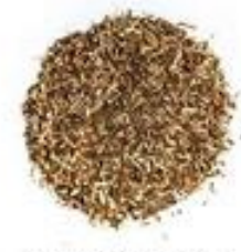
Red Clover - 15g