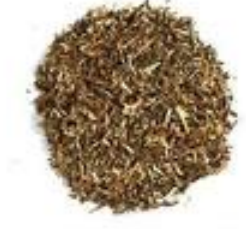
St. John's Wort - 15g