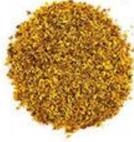
Osmanthus - 15g