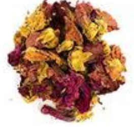
Violet - 15g