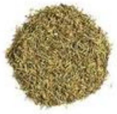
Thyme - 15g