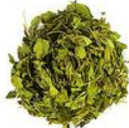
Peppermint Leaf - 15g