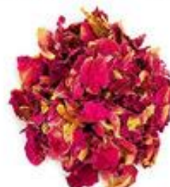
Peony Flower - 15g