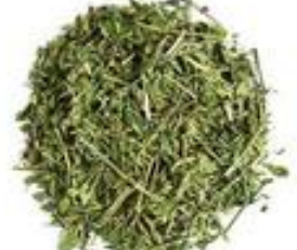
Alfalfa - 15g