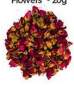
Rose Bud Dried Flowers - 20g