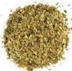
Ginkgo Leaf - 15g