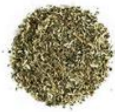
Hyssop - 15g