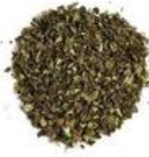
Lemon Balm - 15g