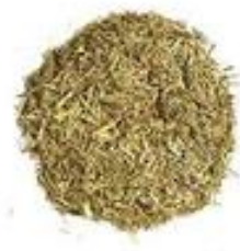
Lemongrass - 15g