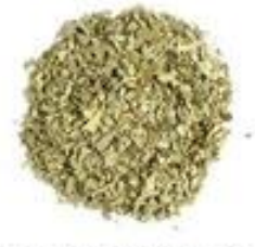
Eucalyptus Leaf - 15g