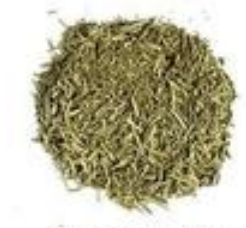
Rosemary - 15g

For Every Bit You Do You Will Have That Much Power Over Littler Pixies, But Be Warned That Without Tea You Will Be Vulnerable To Warlock Attack.