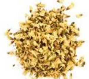
Sophora Flower - 15g