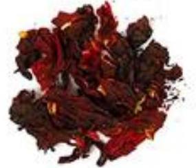
Roselle - 15g