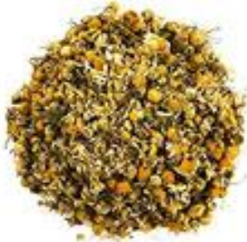
Chamomile - 15g