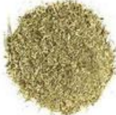
Catnip - 15g