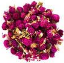
Globe Amaranth - 15g