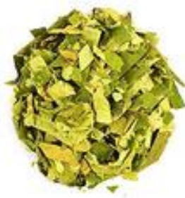
Lotus - 15g