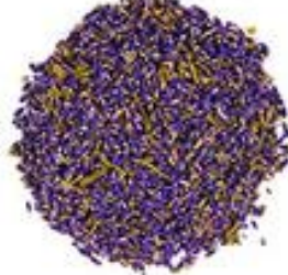
Lavender - 15g