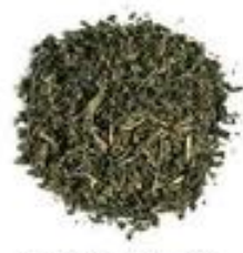
Nettle Leaf - 15g