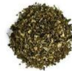
Raspberry Leaf - 15g