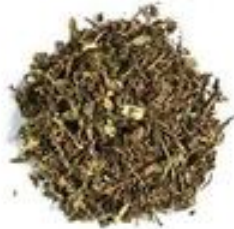
Dandelion Leaf - 15g