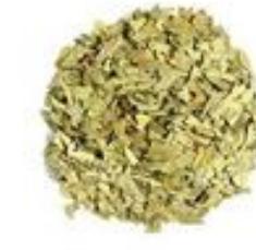
Bay Leaf - 15g