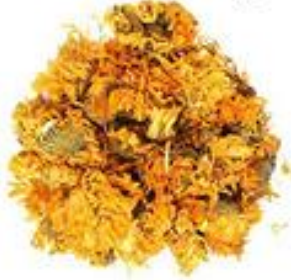
Calendula - 15g