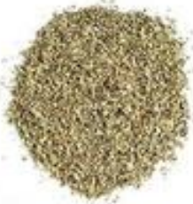
White Sage - 15g