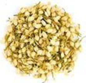
Jasmine - 15g