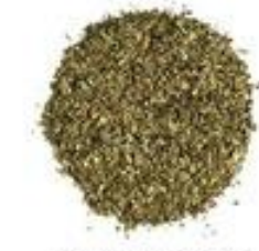
Basil Leaf - 15g