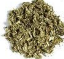
Mugwort - 15g