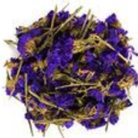
Forget me not - 15g